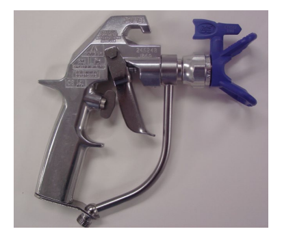
Silver Gun Plus

Follow the specific airless sprayer and spray gun manufacturer's written instructions when using their specific equipment. The Graco Silver Gun Plus<sup>®</sup> is depicted in the following photo. This spray gun can be used for both vertical and horizontal applications. Some Spray Guns will allow filtering in the gun handle. The filters will need to be periodically cleaned and changed to ensure proper liquid flow through the spray gun and tip.