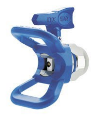
Typical LTX Sprayer Nozzle

Tip Size: LTX525 – has an orifice of 0.025" (0.6mm) and a fan width of 10" (250 mm) holding the nozzle 12" (300 mm) away from the substrate.